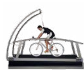
cycling & athletics saturn® 300/100r