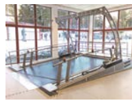
cross country skiing skating / biathlon saturn® 450/300rs