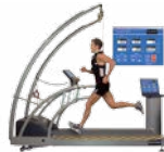
speed training / speedlab pulsar® 3p