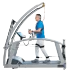
neurology & orthopaedics robowalk expander mercury® med