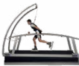
inline skating saturn® 300/125r or saturn® 450/300rs