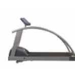
hypoxia altitude simulation mercury® med