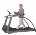
senior fitness mercury® med