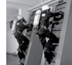
fitness ladder ergometer climbing / fire fighters discovery®