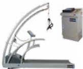
environmental climate chambers pulsar® 3p