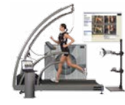
motion analysis Running School® quasar® med / para motion®