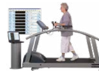
cardiac rehabilitation mercury® med