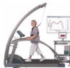
gait analysis / biomechanics h/p/cosmos gaitway II S zebri force-distribution measurement