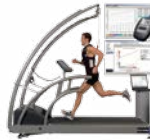
performance diagnostics pulsar® 3p