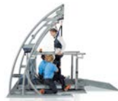
locomotion therapy locomotion® / airwalk