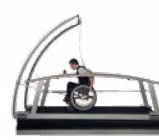
wheelchair saturn® 300/100r