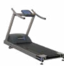
military / army mercury® special version