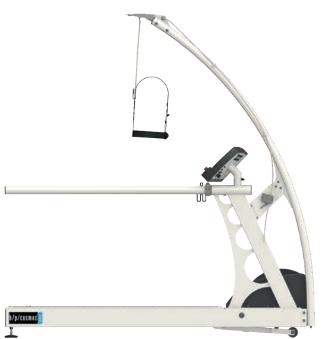
quasar® med with optional long handrails [cos103876] and safety arch fall prevention [cos10079-01va02]