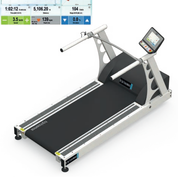
quasar® med with MCU6 [cos30003-01va02]